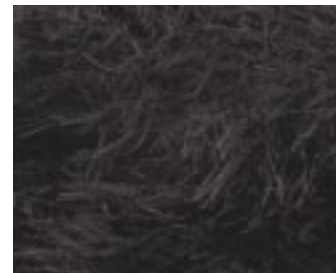
Detail of Yarn